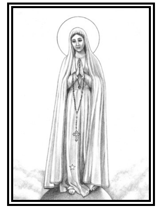
"Those who serve God should not follow the fashions."

"It is often said almost with passive resignation that fashions reflect the customs of a people. But it would be more exact and much more useful to say that they express the decision and moral direction that a nation intends to take: